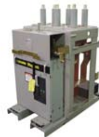
Magnum Replacement Circuit Breaker

Masterpact and Magnum replacement breakers for switchgear modernization are installed, tested and commissioned by factory-trained Square D Service technicians and are backed by a one-year warranty.