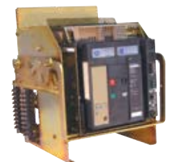
Masterpact Replacement Circuit Breaker