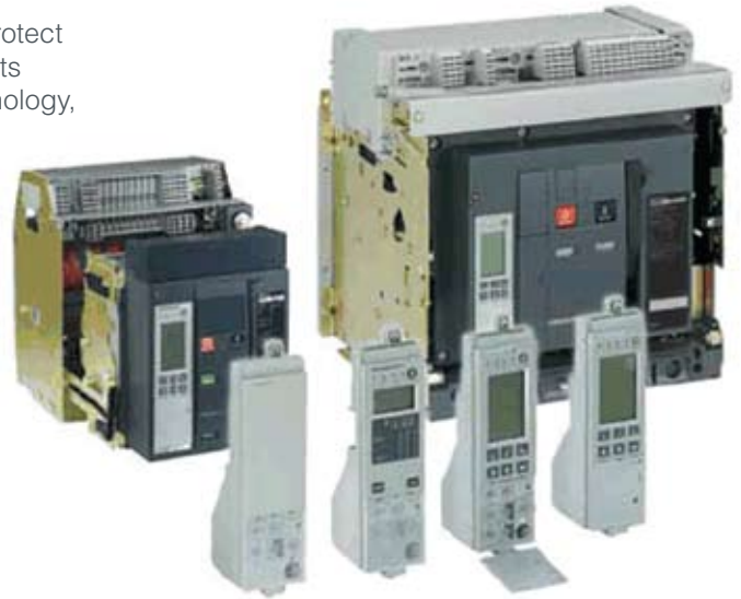
Micrologic Trip Units

Masterpact circuit breakers do not require maintenance under normal operating conditions. Completely modular in design, all replaceable parts can be installed with hand tools and require no critical adjustments.